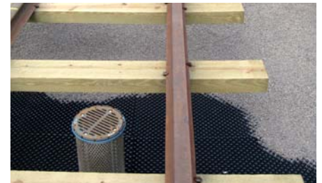
Installation of the green roof build-up under the rails. The drainage layer consists of infilled Floradrain® elements.