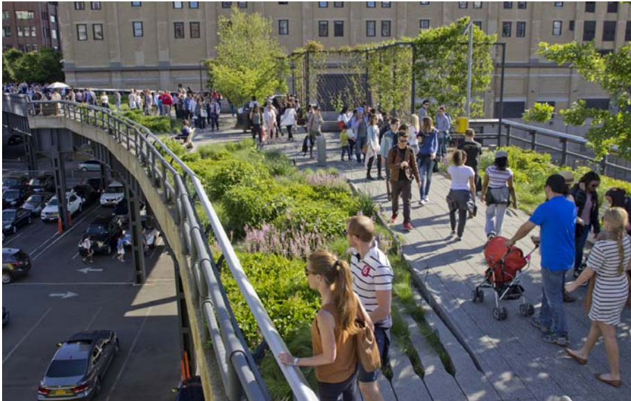
More than 20 million people have visited the High Line Park so far.