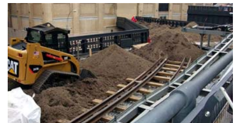
The average substrate depth is 450 mm.