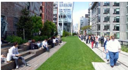
The section 2 with another 800 m of length contains also a lawn which can be used for sunbathing.