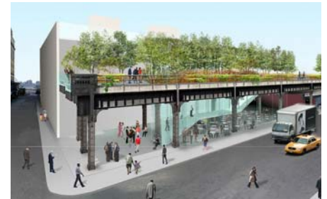
Today's appearance very much resembles this project outline (2003).